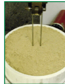
Staple Pull-Out Test