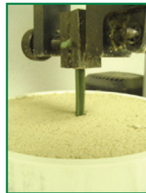
GreenStake Pull-Out Test